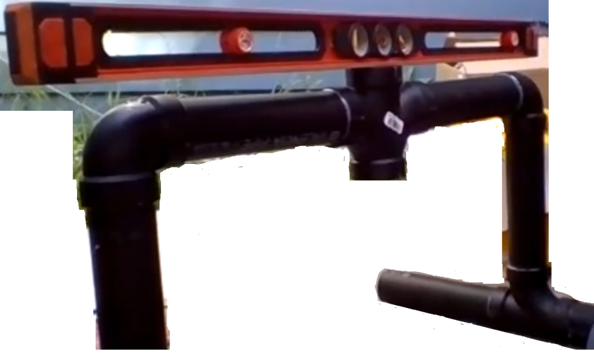
Fig 2. Installation of the apparatus feet.

VIII. Cut the 2 inch pipe (Item a) at 7 feet and mount it on top of the double tee (Item d) at the center of the apparatus. Measure and mark this vertical pipe at an elevation of 50 cm measured from the horizontal surface where the apparatus is standing. Continue measuring and marking the pipe at 25 cm increments until reaching a final mark at an elevation equal to 200 cm.