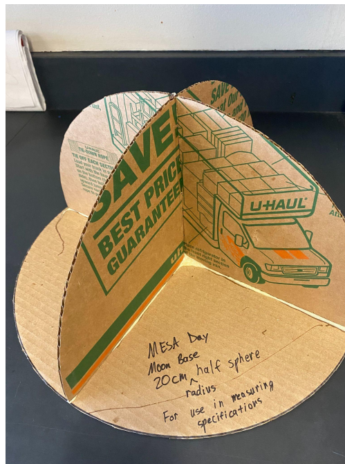
Fig 2. Sample internal measurement tool.