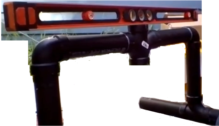
Fig 2. Installation of the apparatus feet.